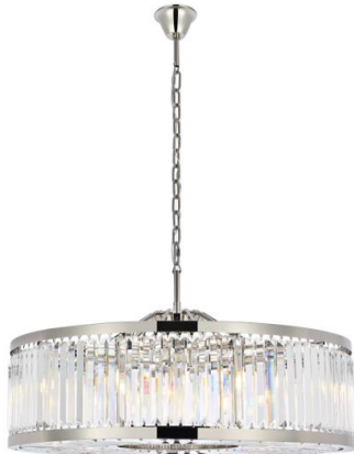
Polished Nickel Item No:1233G43PN